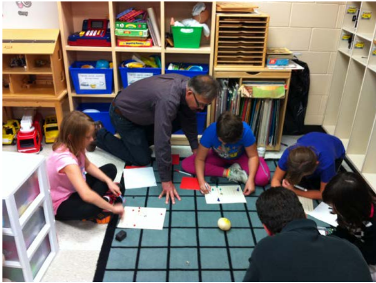
Figure 3 – Children working together on the Playground Problem

After trying several different problems in different elementary grades, our debriefing sessions were facilitating a shift in our views of the nature of problem solving. We realized that perseverance as a problem solving strategy can be experienced in more than one way by children. These kinds of perseverance are try something, try something else, and try something different. As one teacher noted in a debriefing session, “some children can think ahead better than others; some have to just do it and not think ahead.” We were on the verge of realizing a fundamental quality of the nature of problem solving.