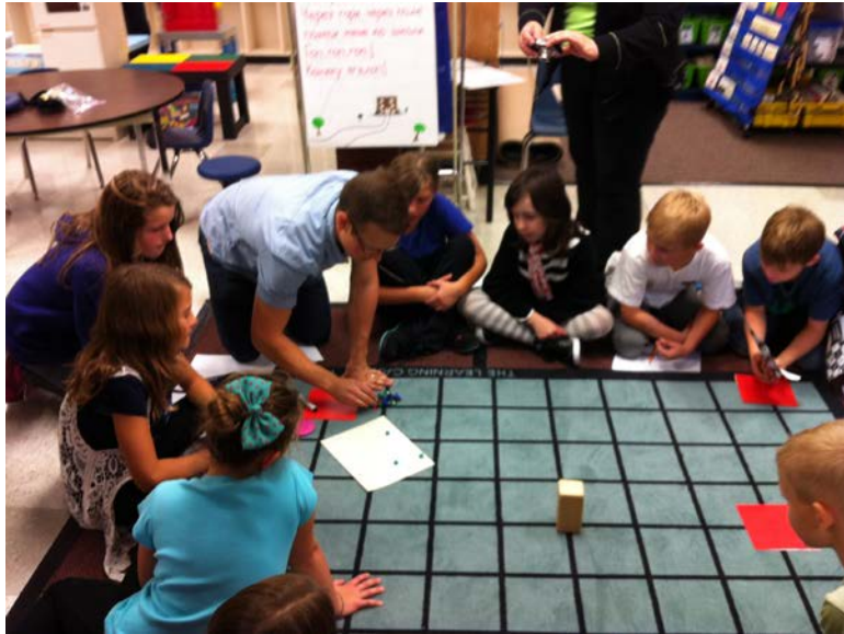
Figure 2 – Launching the Playground Problem on a learning carpet

All groups came up with a similar notion of fairness, consistent with the expected mathematical notion of optimizing average distance. We observed students trying two or three locations and stopping. “Is this enough,” we asked or, “is this the best location?” These prompts were enough to re-initiate and sustain the thinking of the children. Again we observed several problem solving strategies, including different ways of representing the problem (written, hands-on or kinesthetic). Figure 3 shows one group of children working on the problem. Although no group came to a final solution, and all groups struggled, it was clear that the problem was a success in terms of children’s sense making around trying to solve problems.